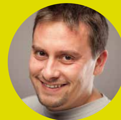
Călin Ilea Photographer & Entrepreneur Photo Squad

"I have always wanted to do what I want, without the hassle of a fixed 8-hour program. I chose to express myself through photography, more than 15 years ago, when the status of employee was the maximum I could hope for. In the meantime, the photography market has changed a lot. You can no longer live only out of passion, without some basic entrepreneurship knowledge and without knowing how to build but, especially, how to maintain your business."